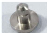
Pos: 086 - Code: KW712916 Description:PLANET HUB NUT