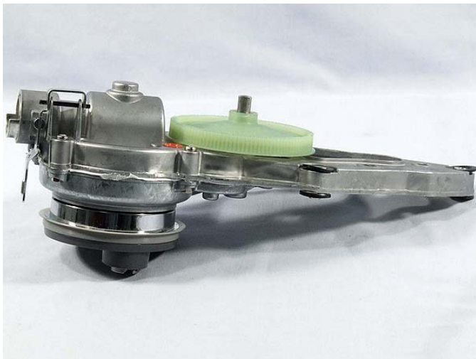
Old Gearbox Assembly KW712912

The new gearbox CAN be retrofit to older models. But please note that the new Gearbox assembly KW715261 does not come with the planet hub cover and sealing ring supplied.