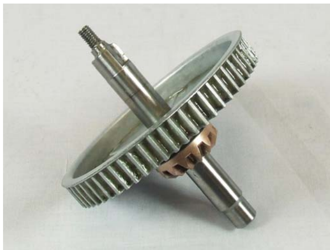
New Vertical Drive Shaft KW715267