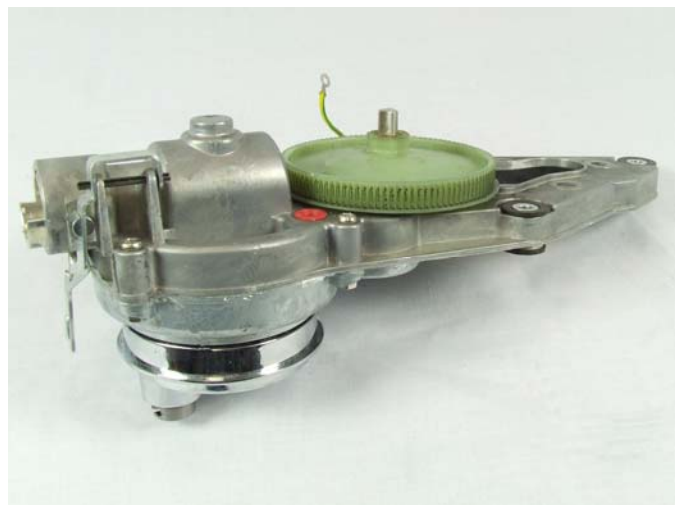
New Gearbox Assembly KW715261

The new planet hub CANNOT be retrofit to older versions without changing the existing gearbox assembly for the new version, or by fitting the new vertical drive shaft, plastic hub cover, sealing ring and hub nut to the existing gearbox.