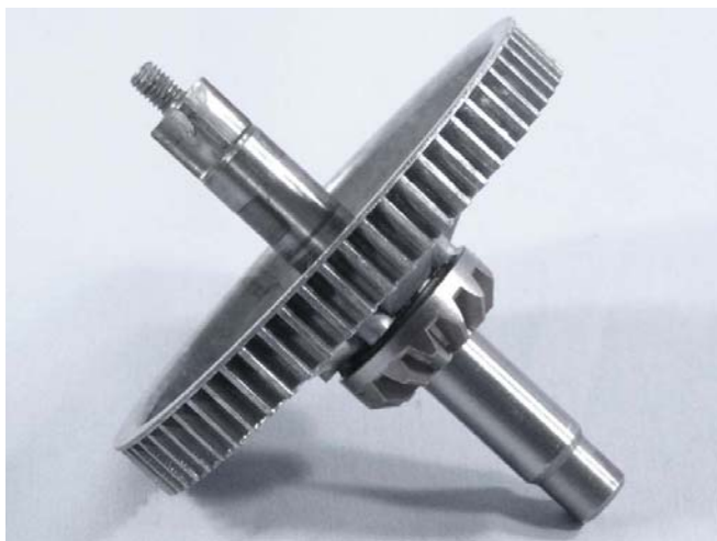
Old Vertical Drive Shaft KW710368