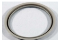
Pos: 084 - Code: KW712914 Description:PLANET HUB SEAL