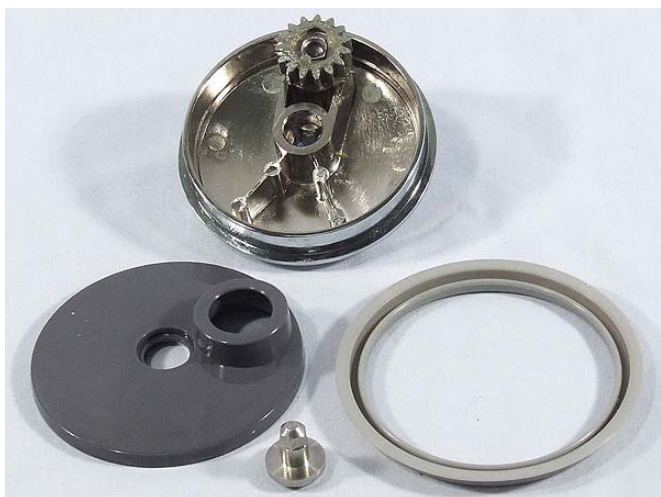
Old Planet Hub, Hub Cover, Seal and Hub Nut KW712913