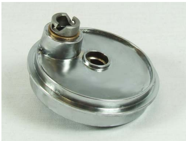
New Planet Hub KW715266