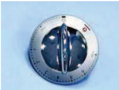
KW666634 - CONTROL KNOB ASSEMBLY (SILVER & CHROME) RECOMMENDED FOR THE KM500 & KM310 CHEF