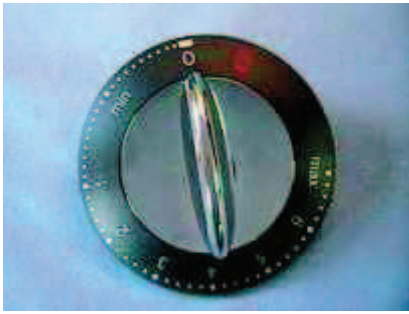
KW660044 - CONTROL KNOB & INSERT - WITH PULSE (GREY/CHROME)