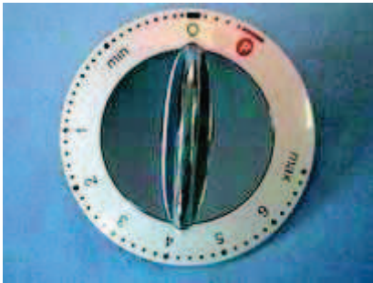
KW660070 - CONTROL KNOB & INSERT - WITH PULSE (WHITE/CHROME)