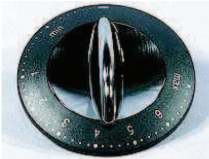
KW660056 - CONTROL KNOB & INSERT - NO PULSE (GREY/CHROME)